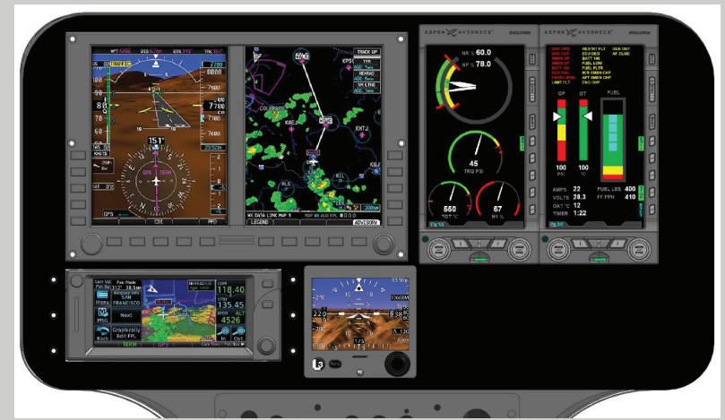
Glass Cockpit with Howell Industries Engine Instrument Display