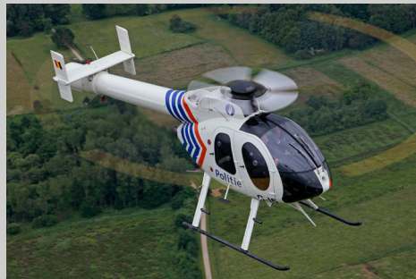
Belgian Federal Police