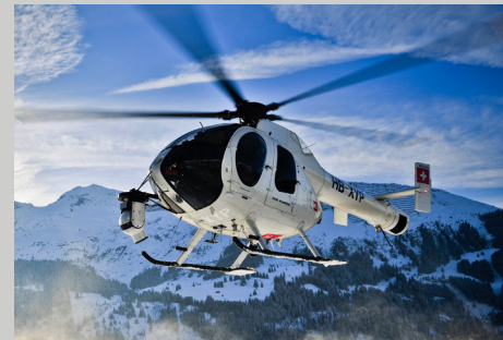
Fuchs Helikopter, Switzerland