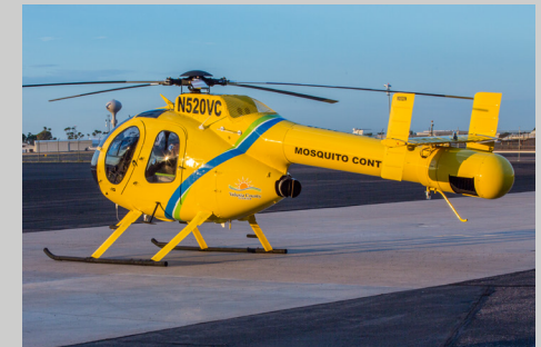
Volusia County (FL) Mosquito Control