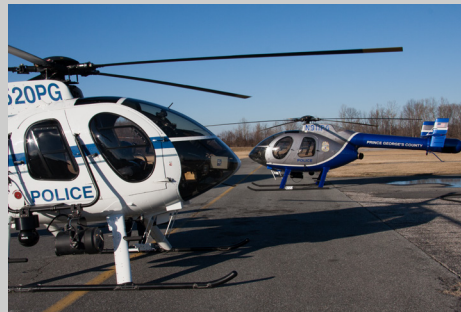
Prince George's County (MD) Police Department